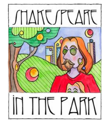
Shakespeare in the Park logo