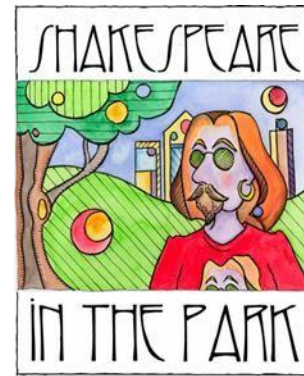
Shakespeare in the Park logo