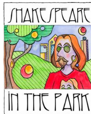
Shakespeare in the Park logo