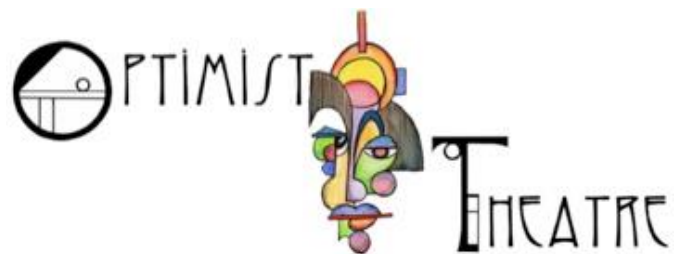
The Optimist Theatre logo