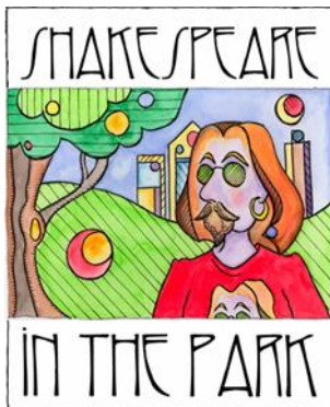
Shakespeare in the Park logo