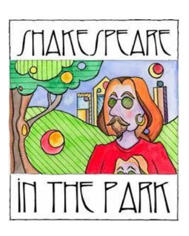
Shakespeare in the Park logo