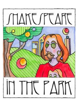
Shakespeare in the Park logo