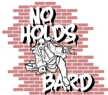
No Holds Bard logo